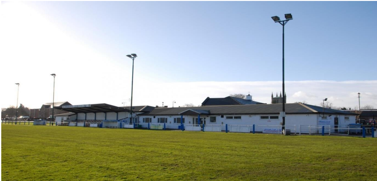
Main Stand and Pavilion

First Bus in Worcestershire X50 to the High Street in Pershore walk a few yards to Redland House and take a left up Cherry Orchard then first right into King Georges Way the ground is on the left.